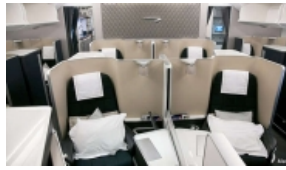
Priority landing for first-class passengers: Out of my...

The Economist explains: Why Islam prohibits images of Muhammad