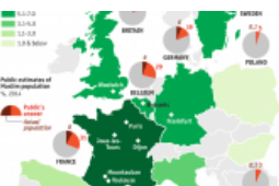
Daily chart: Islam in Europe