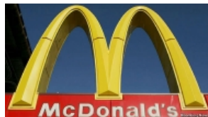
The Economist explains: Why McDonald's sales are falling